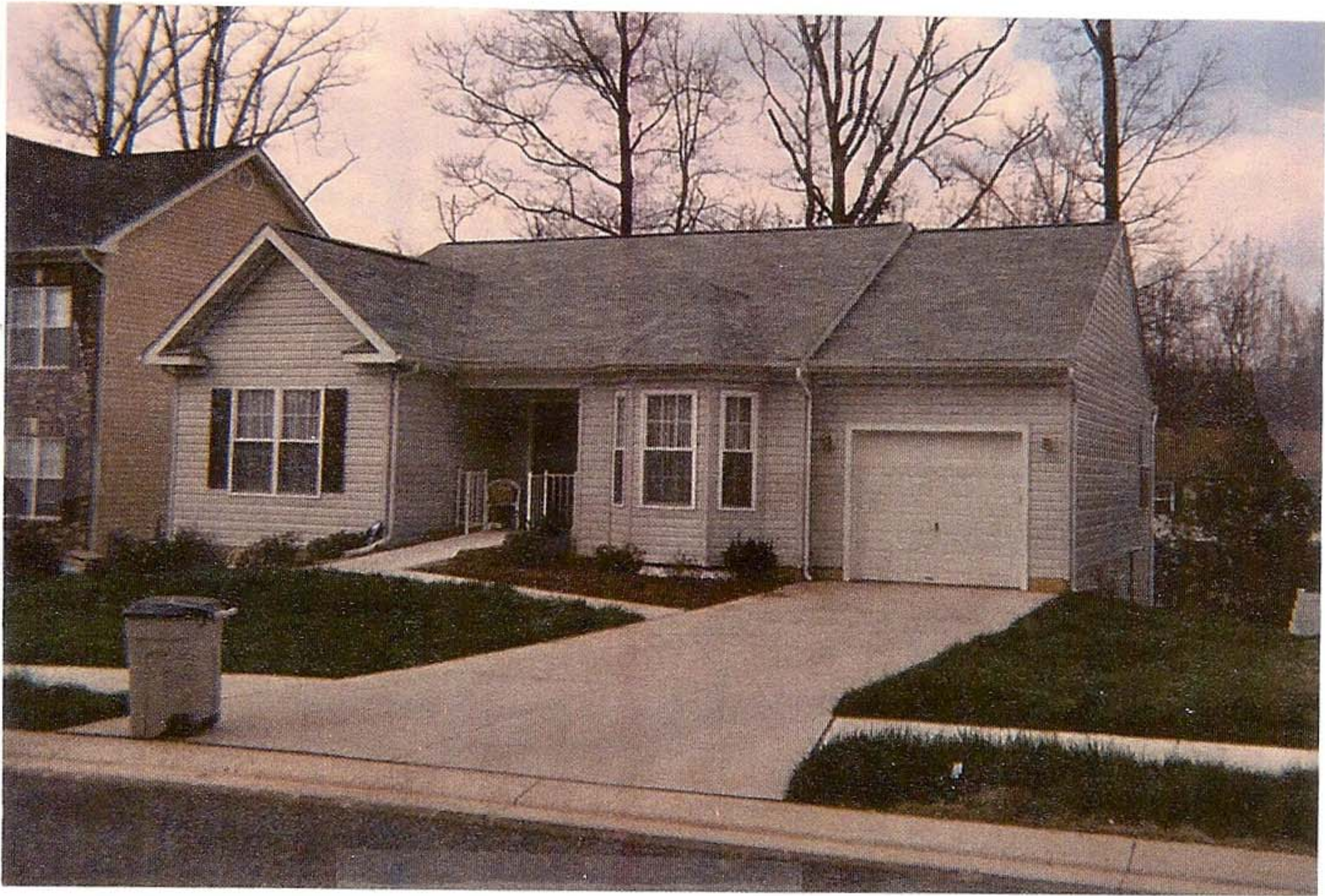
SENECA - D

Where Customization means - MAKING ANY CHANGES THAT YOU DESIRE.